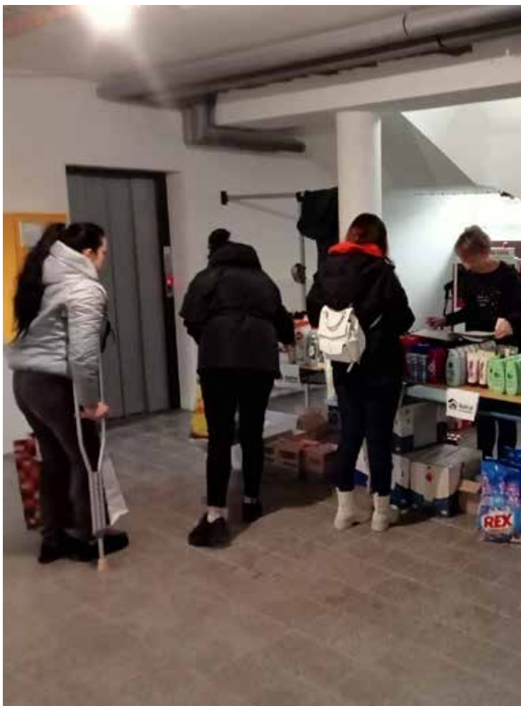
Hygiene materials are distributed in Slovakia.