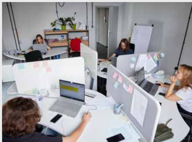
Hotline employees at the Habitat for Humanity Poland office in Warsaw.