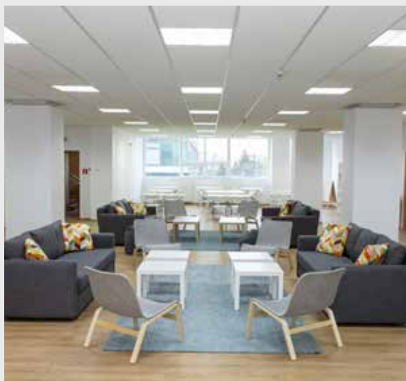
Edmond Center, a formerly abandoned office building in Bucharest, Romania, has been transformed by Habitat Romania to create accommodations and social space for refugees.