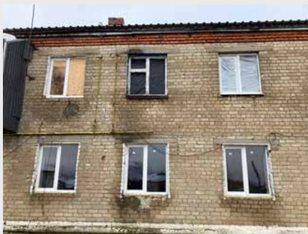
Korbokhyne is a community in the liberated and former frontline in Kharkiv Oblast of eastern Ukraine. Thousands of houses, apartment blocks and schools in the area have been damaged by shelling, tank fire and airstrikes.