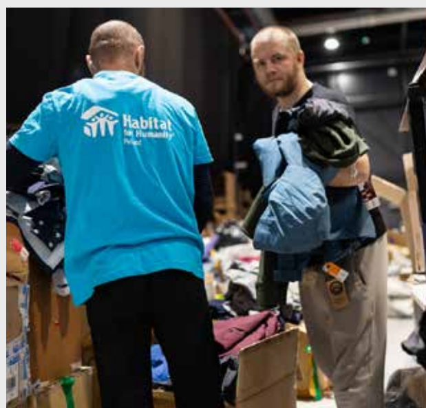
Winterization efforts at the Global Expo site in Warsaw, Poland, include bringing in mattresses and coats. The site has the capacity to host up to 5,000 people, making it one of the largest centers for refugees.