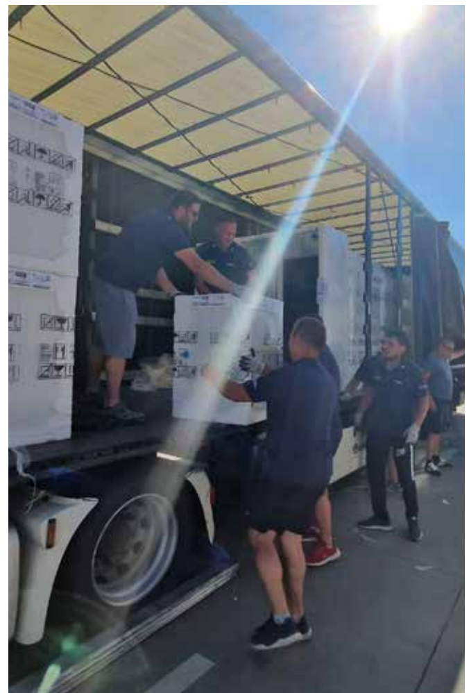
Appliances are delivered in eastern Slovakia.