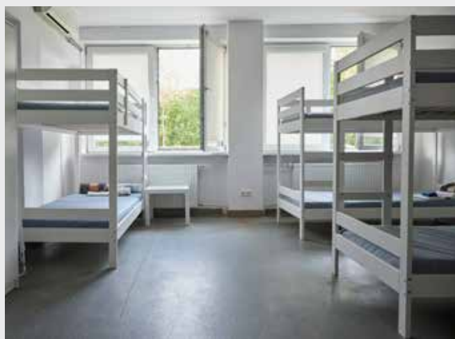
This property serves as temporary housing for Ukrainian refugees in transit in Warsaw, Poland.

Partnerships and advocacy: In 2022, we partnered with a range of strategic stakeholders engaged in supporting the housing sector in Poland, including the International Organization for Migration and UNHCR, the U.N. Refugee Agency, which resulted in Habitat Poland co-leading the Shelter Working Group, which convenes aid organizations addressing the housing needs of refugees in Poland. Establishing these relationships and influencing the housing ecosystem by advocating for the adoption of the Social Rental Agency model at scale constitutes a significant milestone for Habitat in Poland and for the broader region. Thanks to our partnership with the city of Warsaw, we are able to renovate empty spaces and pilot social rental housing units. Similar coordination has occurred with municipalities and authorities in the Silesian region.